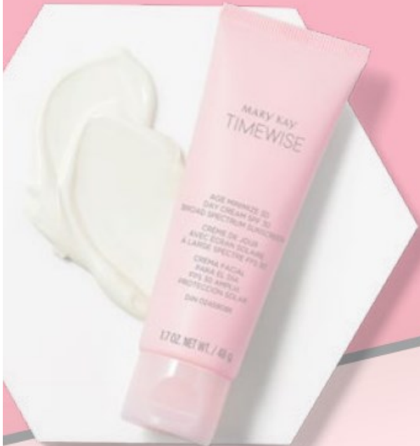
TIMEWISE® AGE MINIMIZE 3D® DAY CREAM SPF 30 BROAD SPECTRUM SUNSCREEN*